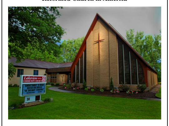
30 Long Pond Road Rochester, NY 14612