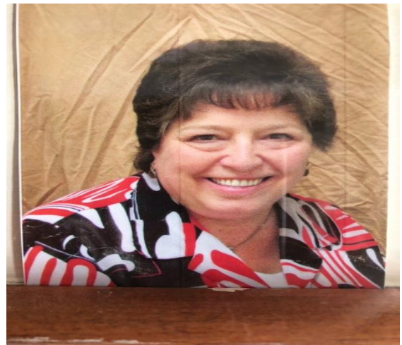
Member of Lakeview since November 28, 2004